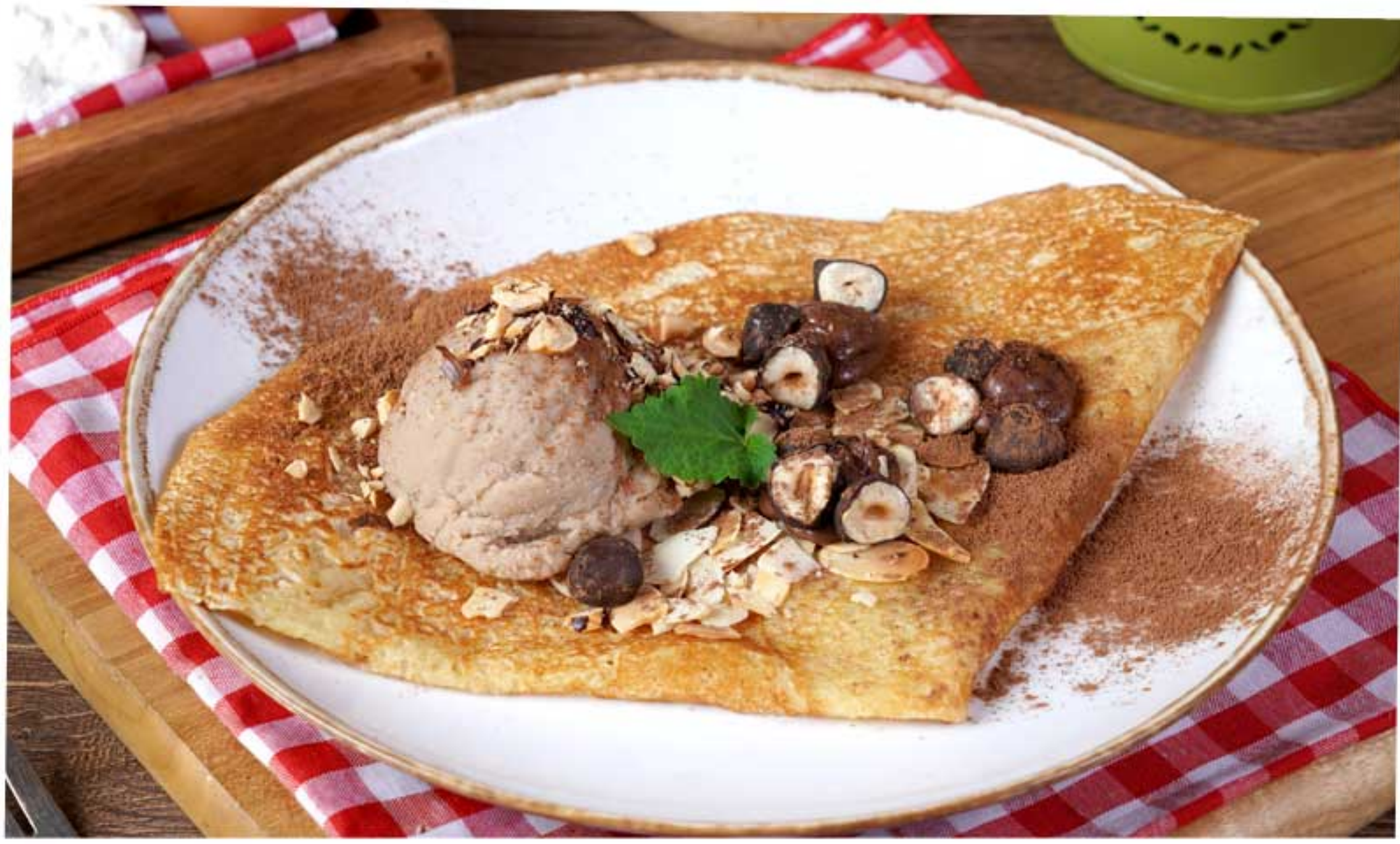
Nutella Hazelnut Crepe