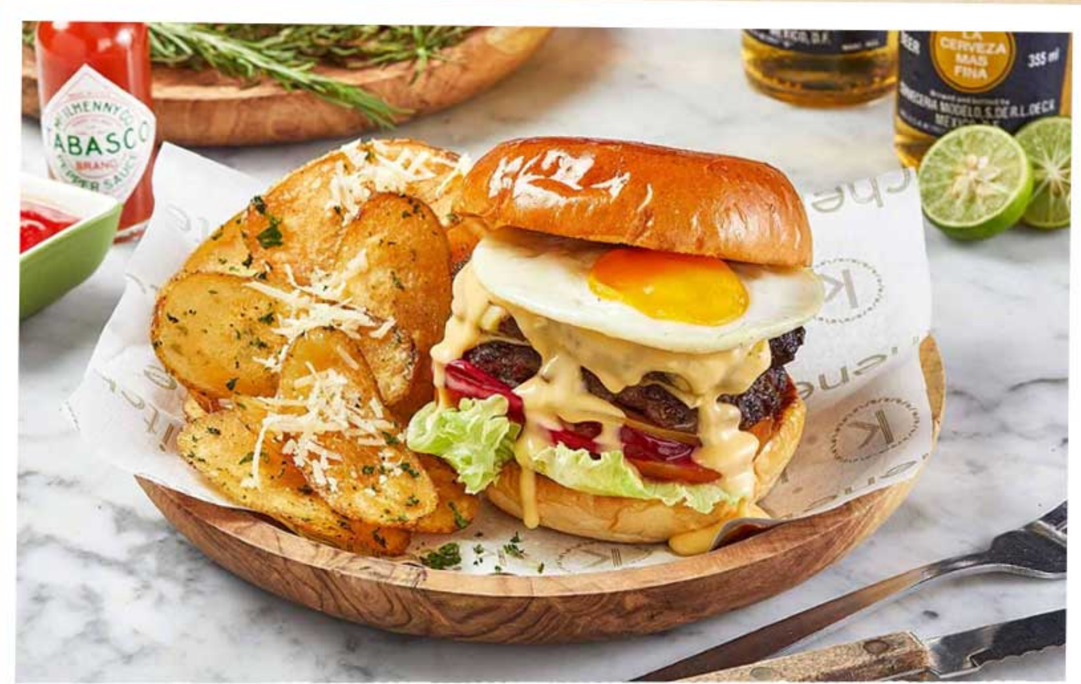
Classic Double Cheese Burger