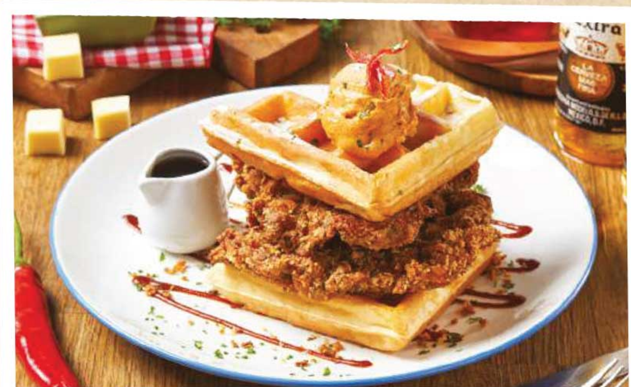
Boneless Fried Chicken with Waffles