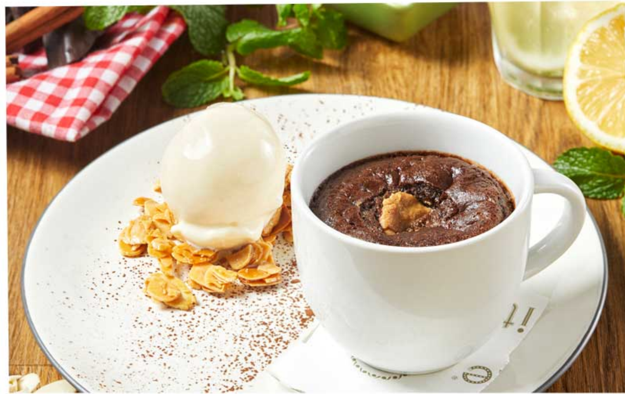
Chocolate Peanut Butter Lava Cake