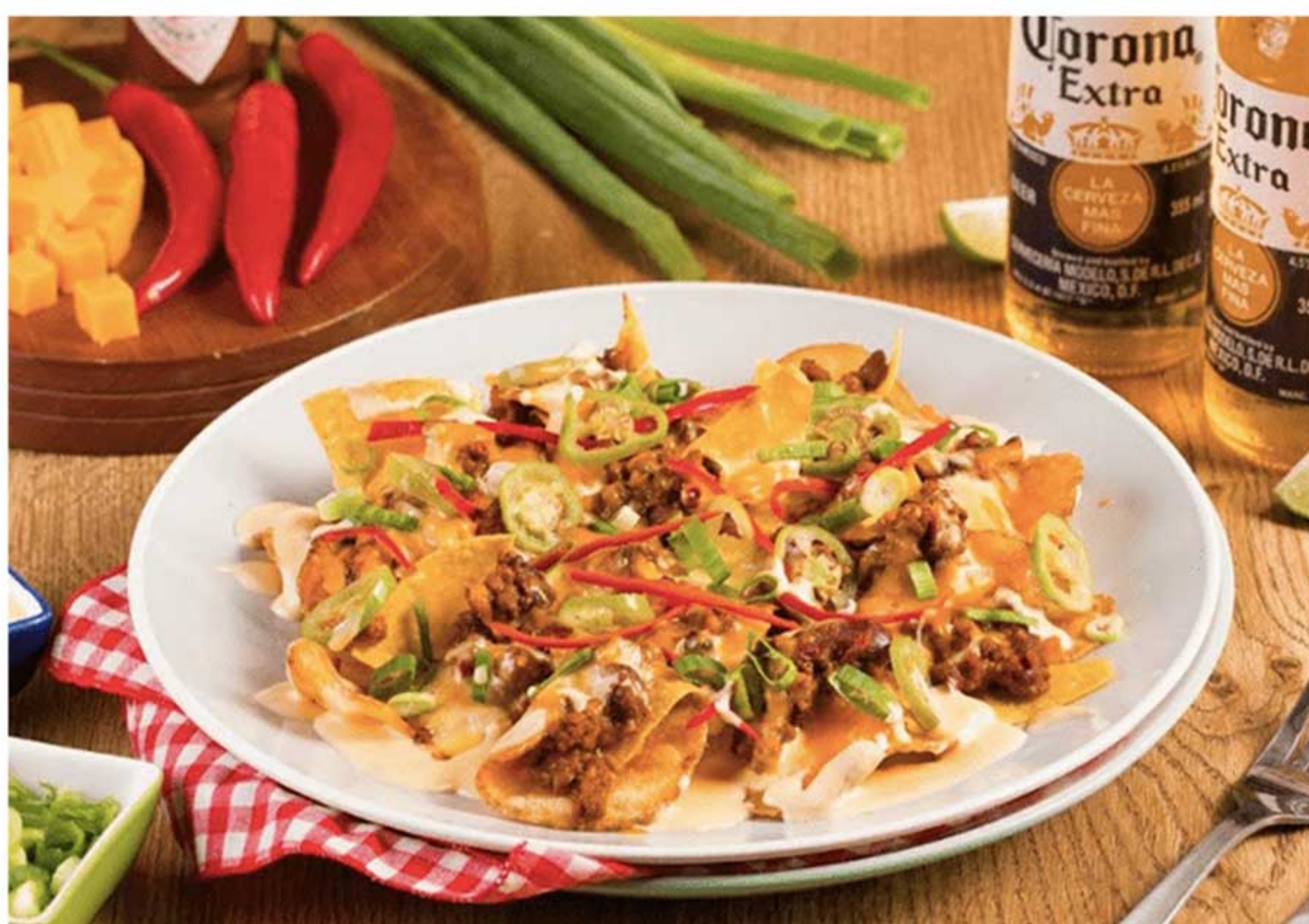
"Nachos Style" Crispy Potato Chips