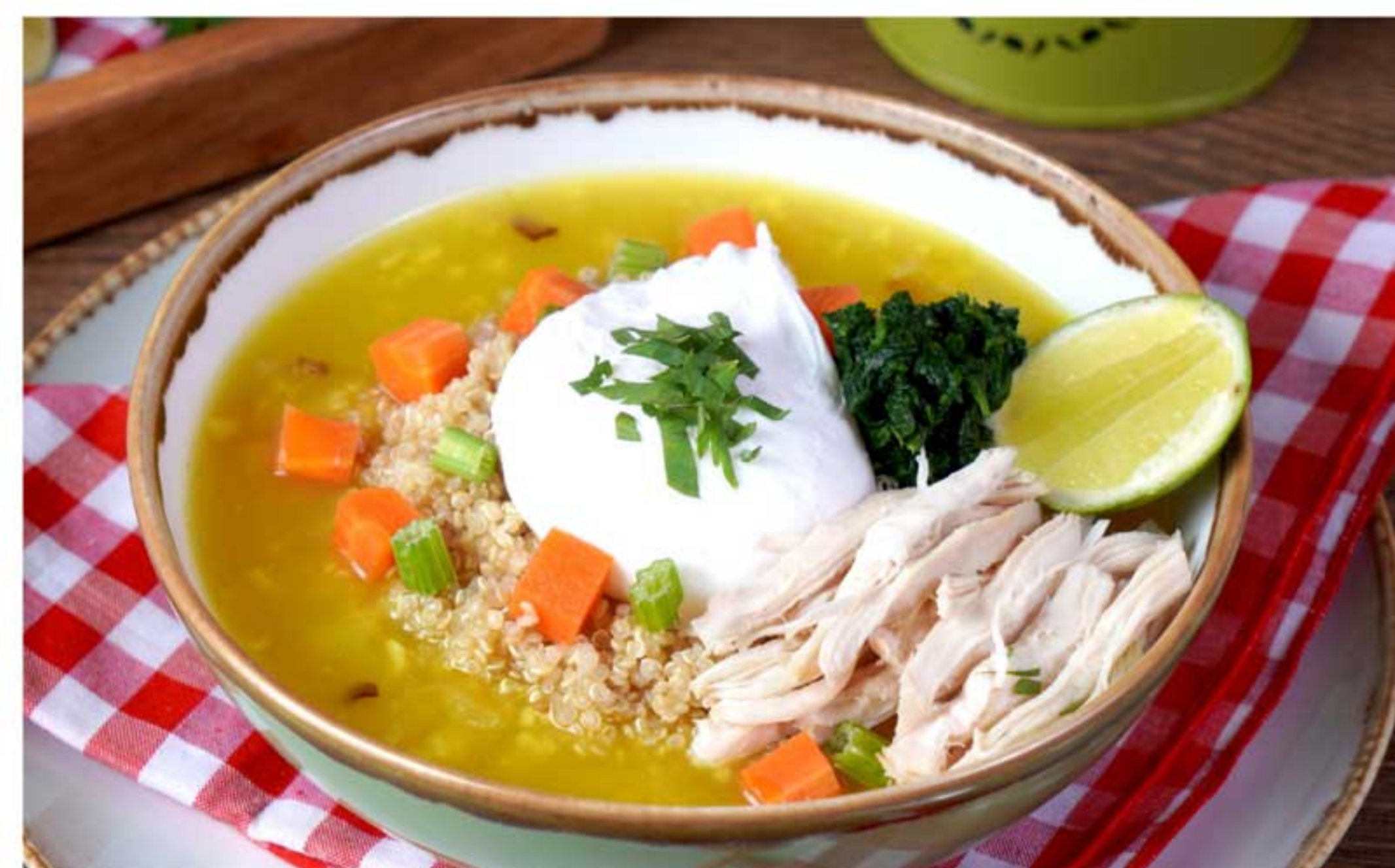
Chicken Collagen Soup