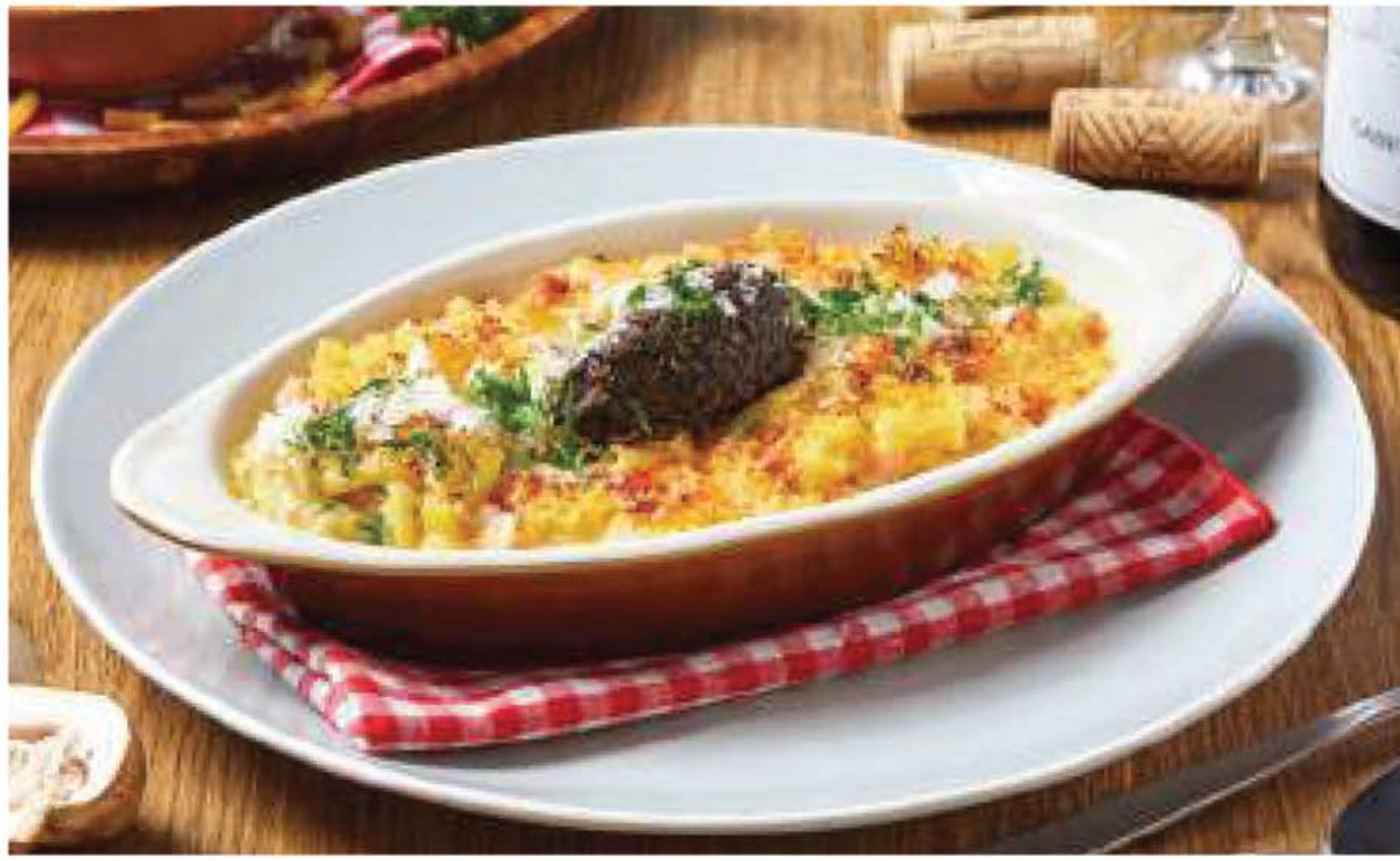
Baked Truffle Macaroni