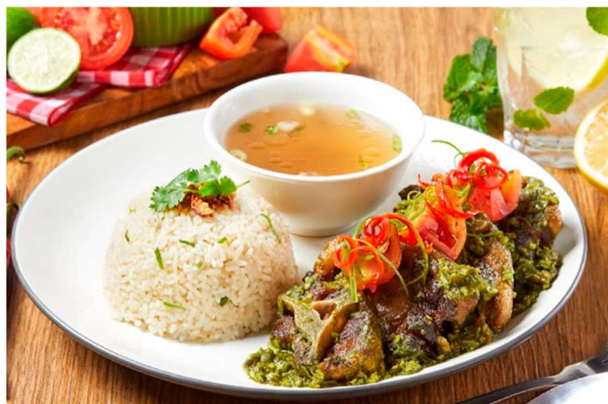
Spicy Fried Oxtail