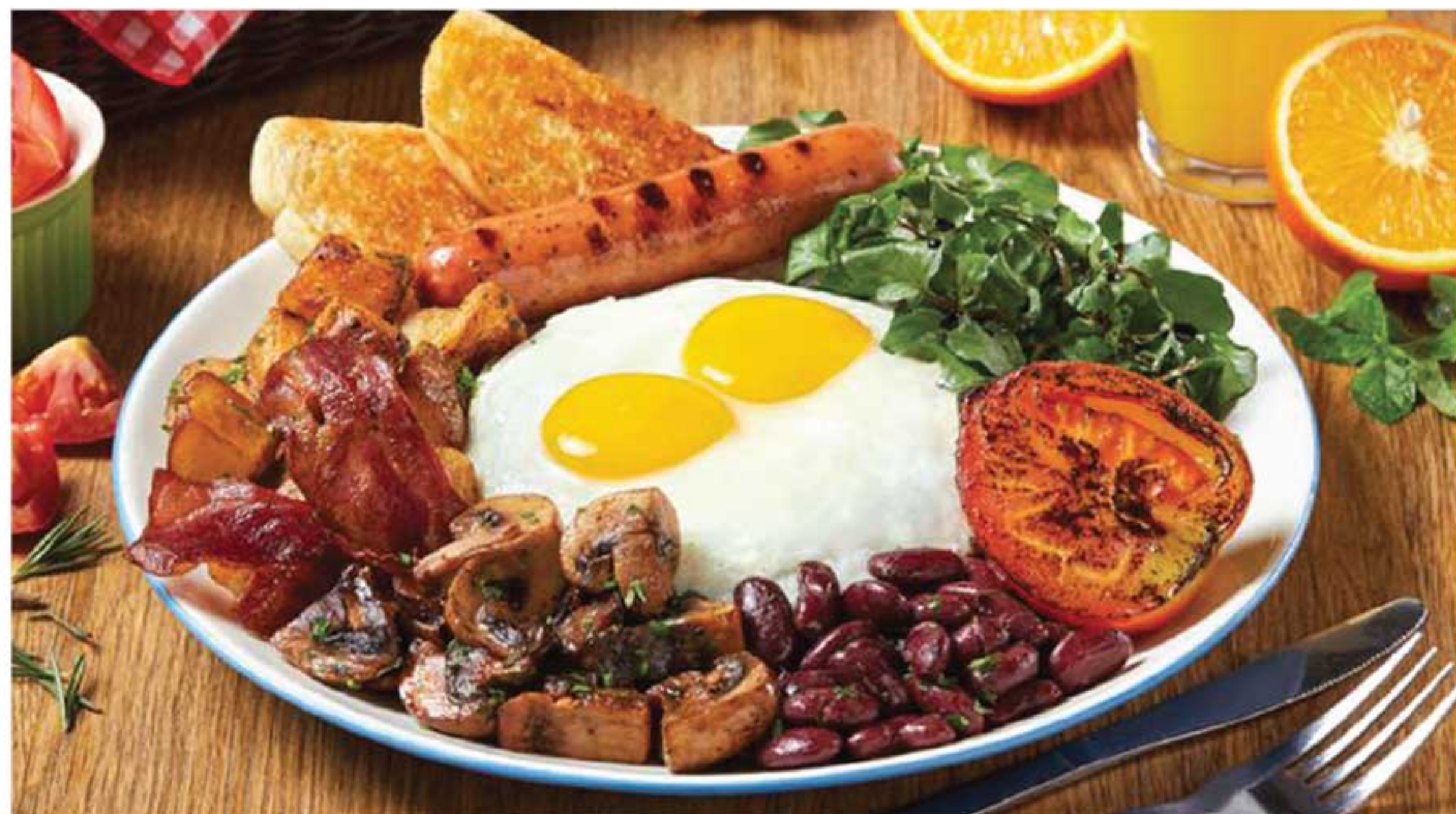
Kitchenette Big Breakfast