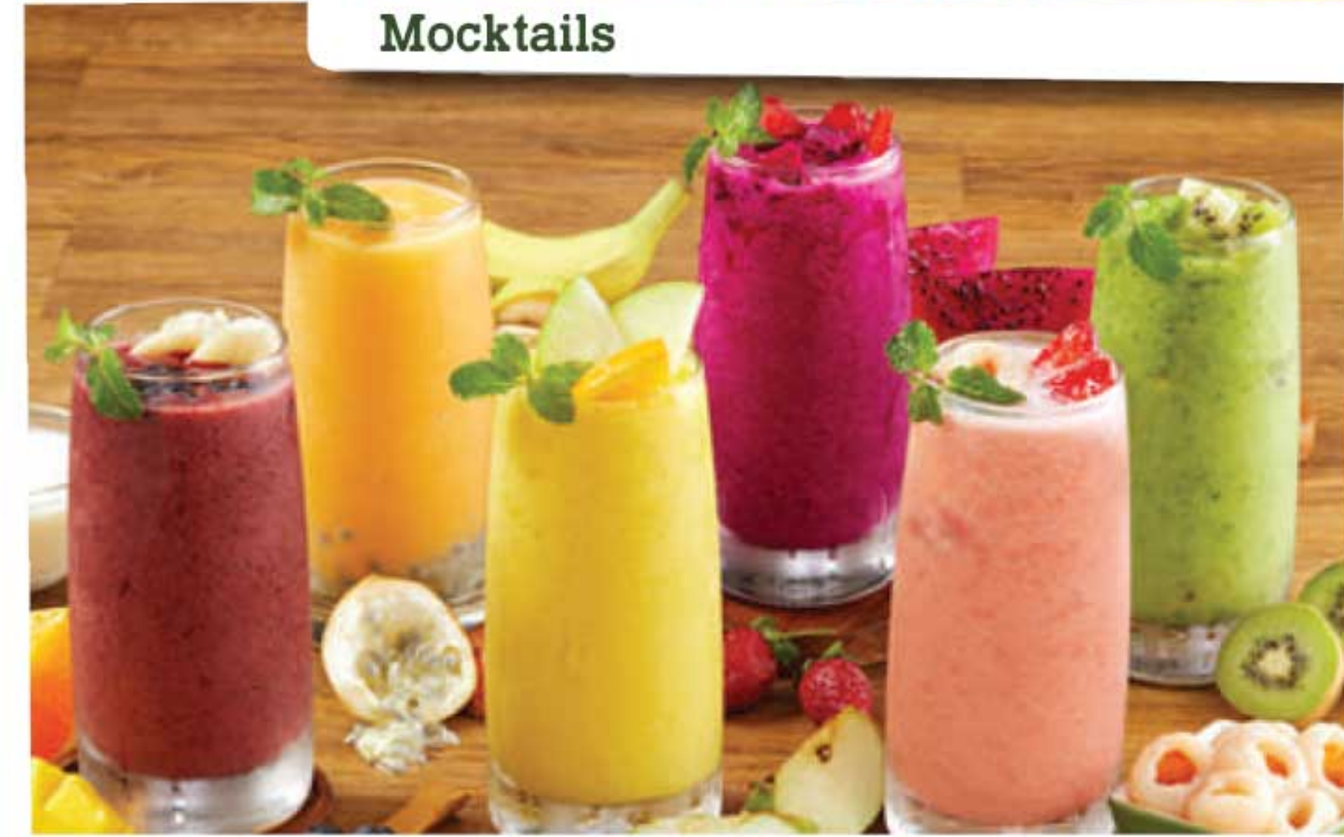
Shakes & Smoothies